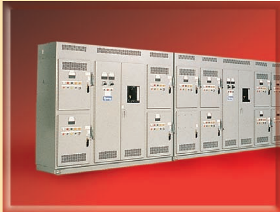
32 Zone AC Power System for an Industrial Heating Application

Spang's design and application expertise combine to deliver AC Power Systems and DC Rectifier conversion products, unsurpassed for reliability, energy efficiency and service life.