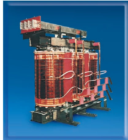
2000 KVA Transformer — Open Frame