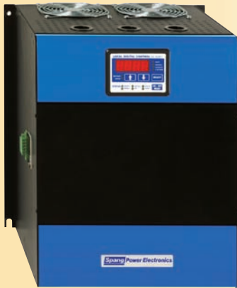
853 3-Phase SCR Power Controller

The 850 Series Digital Power Controller offers state-of-the-art power control technology.