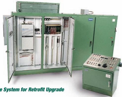
DC Drive System for Retrofit Upgrade