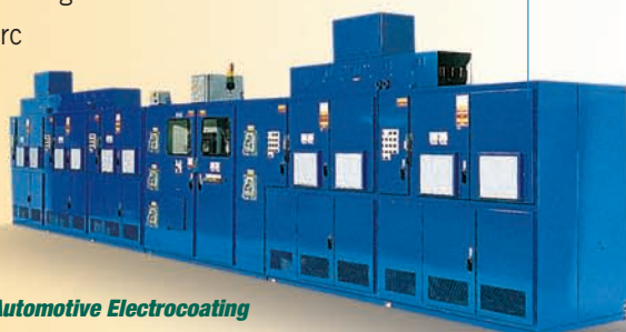
DC Power Center for Automotive Electrocoating