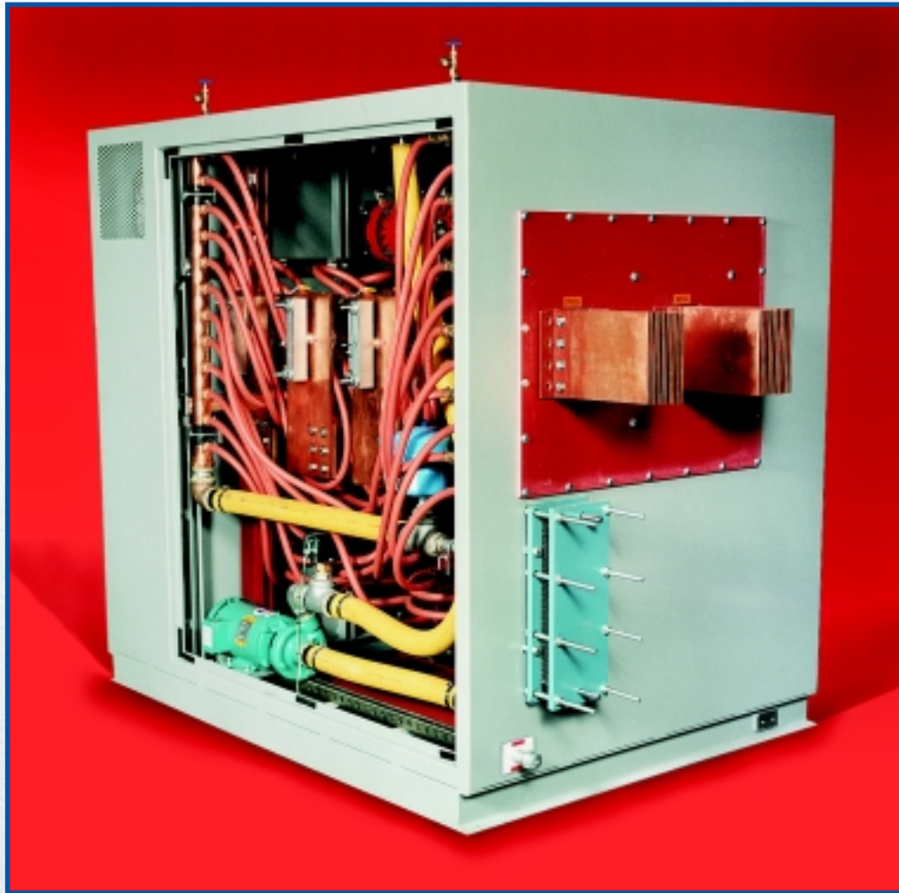
Water Cooled Electrowinning Rectifier, 20,000 ADC