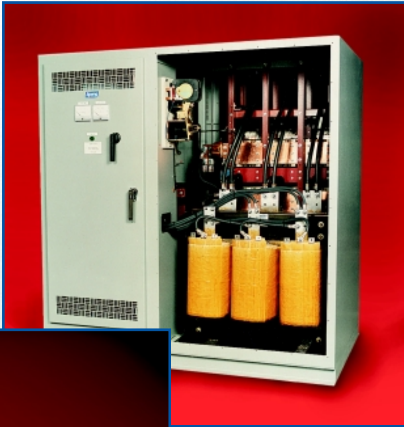
Unregulated 500 KW Crane Rectifier with Regeneration