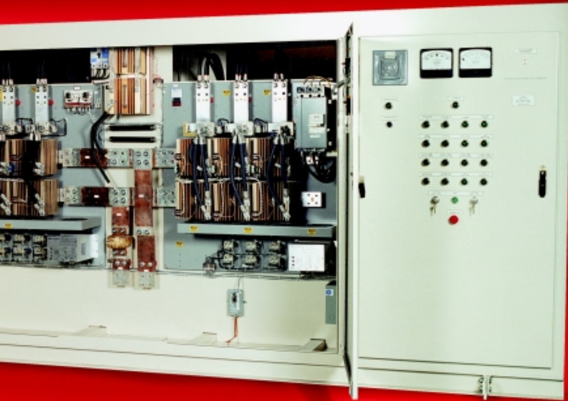
220 KW Water Cooled Super Conductor Magnet Power Supply