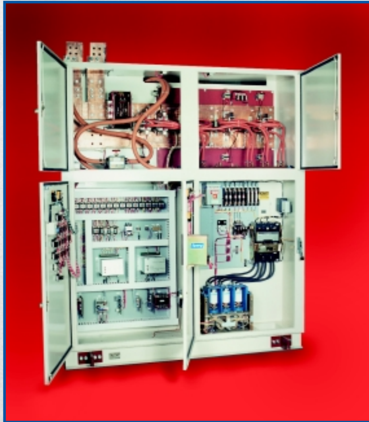
Cover: Regulated 1500 KW Crane Rectifier with Regeneration Above: 360 KW Water Cooled Magnet Power Supply

Spang heavy-duty DC power supplies are designed to operate within harsh environments. They provide DC power for any industrial application including: mill duty cranes, electromagnets, ladles, plasma arc, synchronous motors, municipal transit, electrochemical and electrowinning applications.