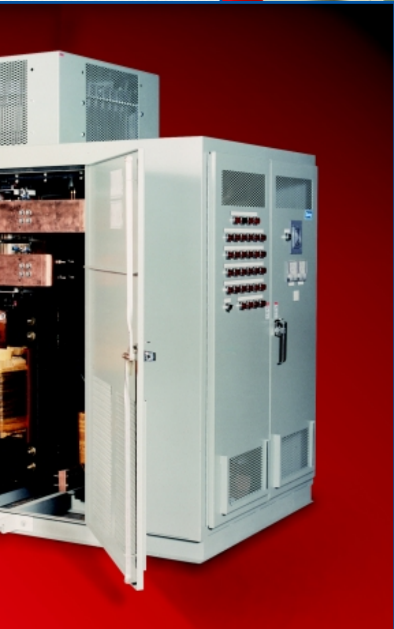
Unregulated 1500 KW 12-Pulse Crane Rectifier with Regeneration