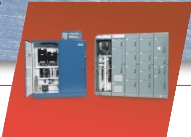
COORDINATED DRIVE CONTROL