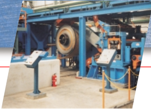
■ WINDER CONTROL