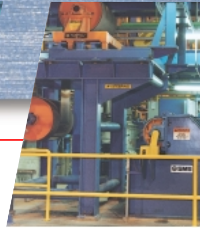
■ TENSION & POSITION